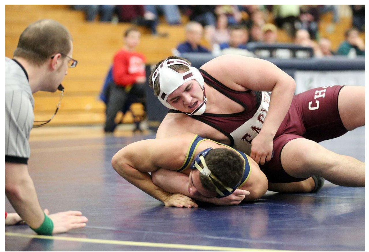
Being thrown into the 285-pound weight class as a freshman can be traumatizing to any wrestler.

There are certainly success stories, and maybe the case can be made that the lumps taken when younger can lead to plenty of success during the second half of a varsity career.